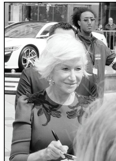
Helen Mirren stars in "Winchester"

The scattered script is stretched to fill the time. Jason Clarke's Dr. Pryce, brought in to determine if Old Lady Winchester has gone cuckoo, does