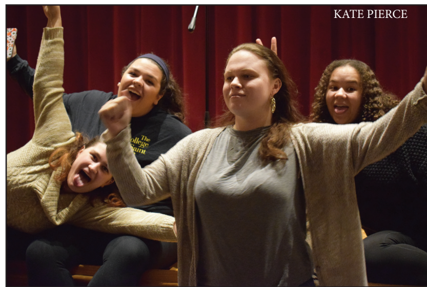
Members of the Student Events Board executive board.