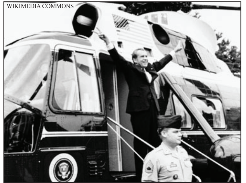
Richard Nixon leaving the White House grounds after his resignation.

Republicans, including the president, believe this memo discredits the F.B.I.’s investigation into the Trump campaigns connections to Russia, and the president’s clear attempts to obstruct that investigation. They see what is com-