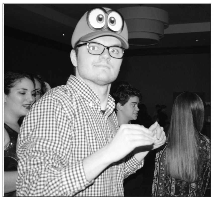
Best Buddies Friendship Ball February 2nd 2018 Hilton Garden Inn, Troy