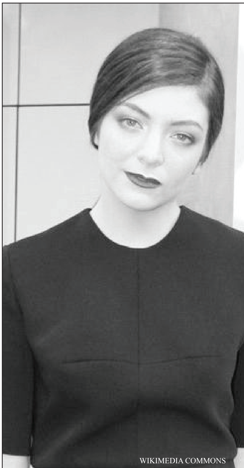
New Zealand singer Lorde at the ARIA Music Awards in 2013.

as well as her newfound “lust for life,” to quote her title track.