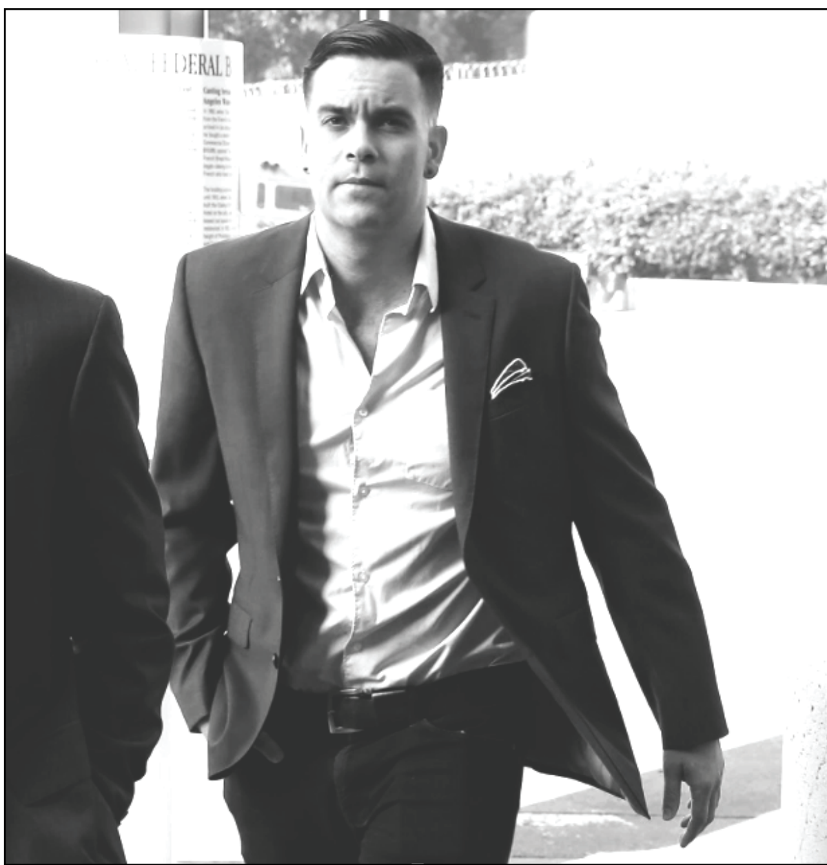
Mark Salling was found dead after an attempted suicide after indictment of child pornography charges

Most of the other Glee alumni have remained silent so far, and have not commented on the actor's death. However, Iqbal Theba who played Principle Higgins, tweeted several times pertaining to the actor's death. One tweet has a picture of the cast receiving the SAG Award for their first season with the caption "At #SAGAWARDS @GLEEonFOX after we won.