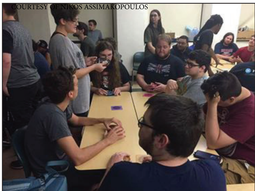
A typical meeting arrangement for Geeks of the Round Table.