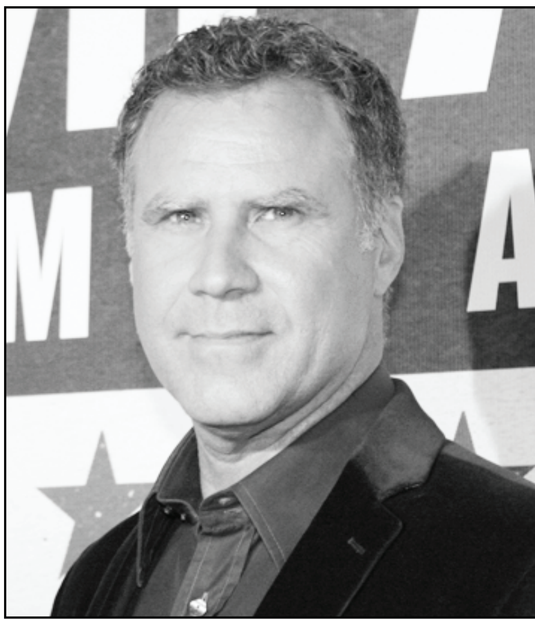
Will Ferrell appeared on Saturday Night Live

Shortly after, cast members Kenan Thompson and Cecily Strong loaded him onto a stretcher and Ferrell yelled out, "We have a great show for you tonight, Nelly Furtado is here!" However, Chris Stapleton was actually the musical guest that night. The witty monologue had truly set-up the tone for an