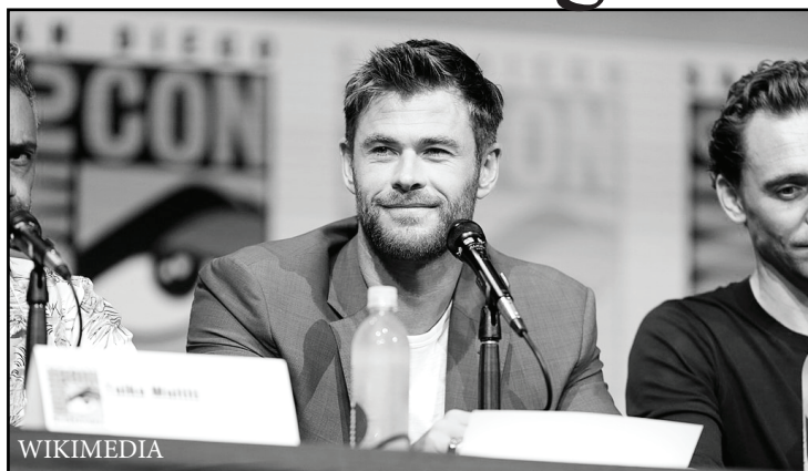
Chris Hemsworth stars as Thor in the newest addition to the Marvel Cinematic Universe

The positive elements of Thor make a strong impression as the returning characters shine once again. Thor and Loki still command the screen with such charisma and humor. Along with familiar faces, we get some great new characters. Although not new to the Marvel Cinematic Universe (MCU), Hulk brings some great ener-