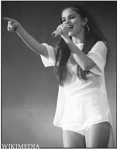
Selena Gomez released a mini documentary with Coach.