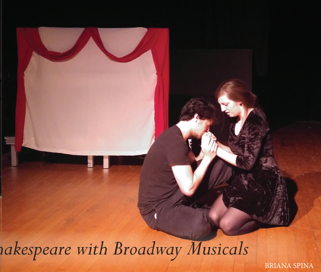
Mixing Shakespeare with Broadway Musicals