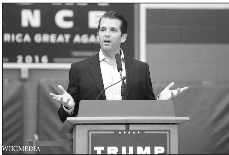
Donald Trump Jr was ridiculed on social media for his misuse of the word "to."

Scrolling through social media is often times harmless. Users post about his or her daily activities, or discuss latest trends and political scandals. But in some cases, it becomes daunting as you witness again the misuse of grammar in a 140-character tweet or Facebook post. Your blood begins to boil as you find yourself screaming at your computer screen that it is not "your" it is "you're."