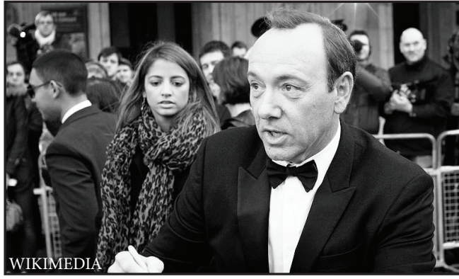
House of Cards was taken off the air due to Kevin Spacey being accused of sexual harassment.

At this point, some people are probably wondering why there have been so many people convicted of sexual assault within a short amount of time, along with an overwhelmingly large amount of accusers. These serial predators have not committed all of these acts of crimes recently, they have been doing so for quite a while and some have threatened their victims that if they were to tell anyone, worse things will happen. Victims have been feeling empowered and not letting their abuser go off the hook for their wrong doings.