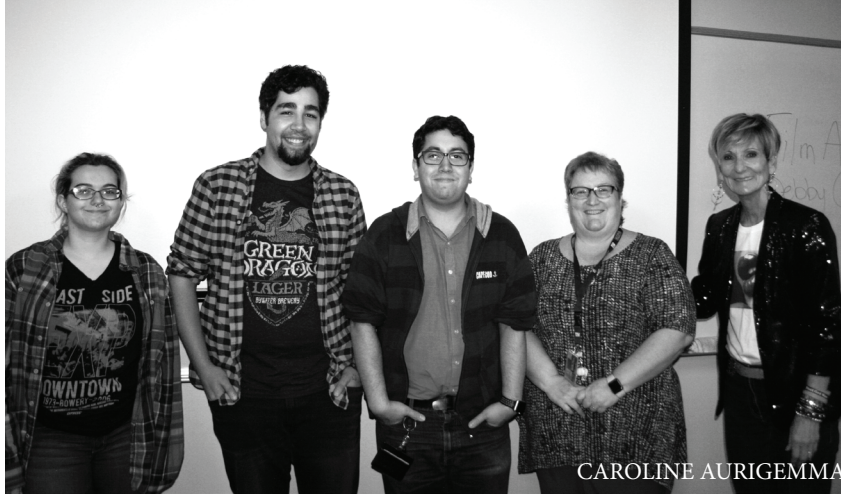
Three current students and McGrath attended the presentation to learn about the advantages of filming in Albany

"It's gratifying that you've been able to make it all happen," said Goedeke.