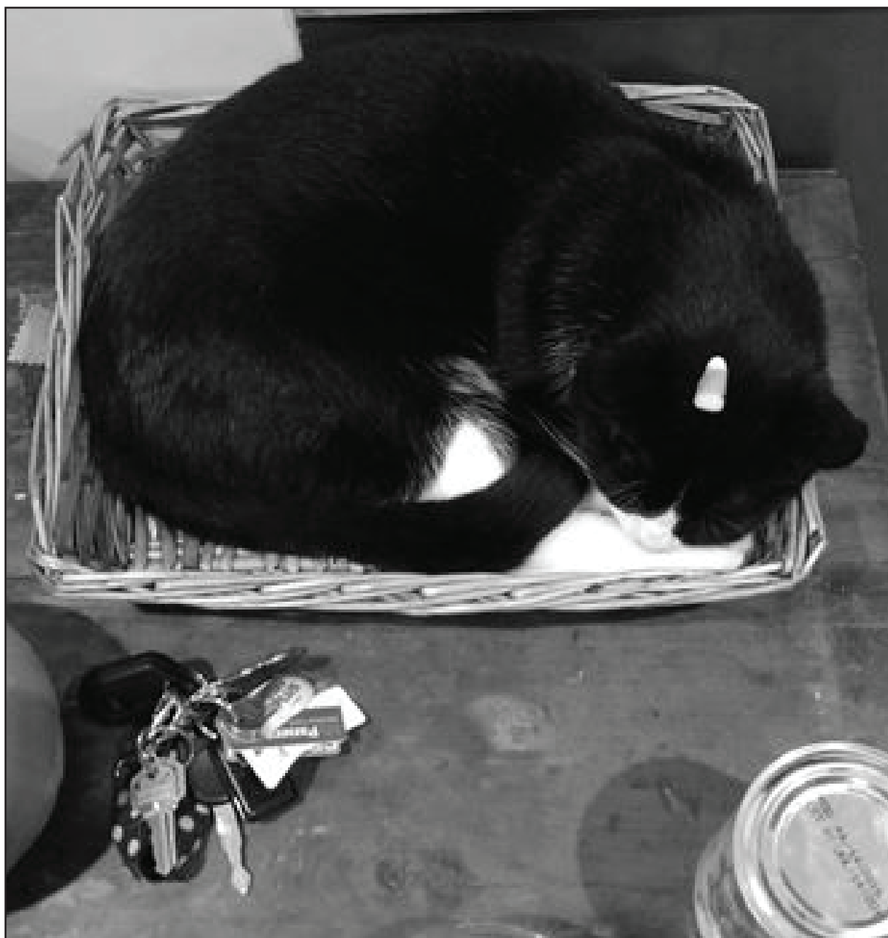
Tipsy, a cat, is dressed as candy corn. He is not appropriating anyone’s culture.

American Indian costumes: these typically consist of very basic staples such as faux-leather dresses or robes, fringe, beads, and feathers. It is dreadfully inaccurate to try and encapsulate their entire culture using a few trite pieces of it, for there are many cultural variances between tribes. Though these costumes can be perceived as what the average American Indian looks like, that is also not accurate. Feather headdresses, for example, are not worn by just any Native American: a select few have the honor of wearing it be-