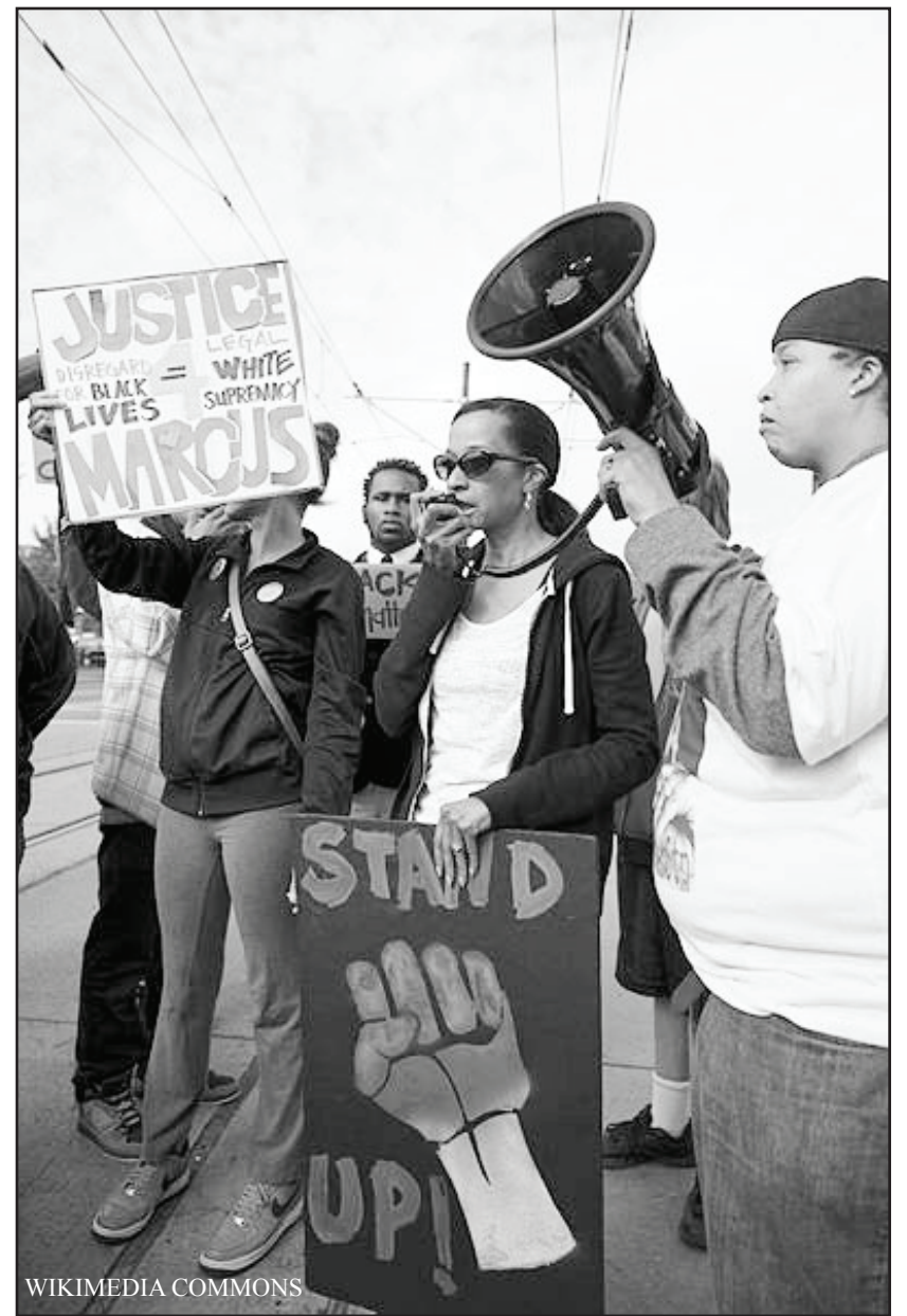
Protestors in 2015 lined the streets in Minnesota to stand up for mistreatment of black men and women in society.