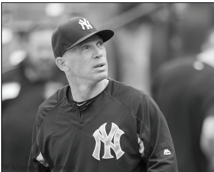
Girardi led the Yankees to the ALCS in his tenth year.