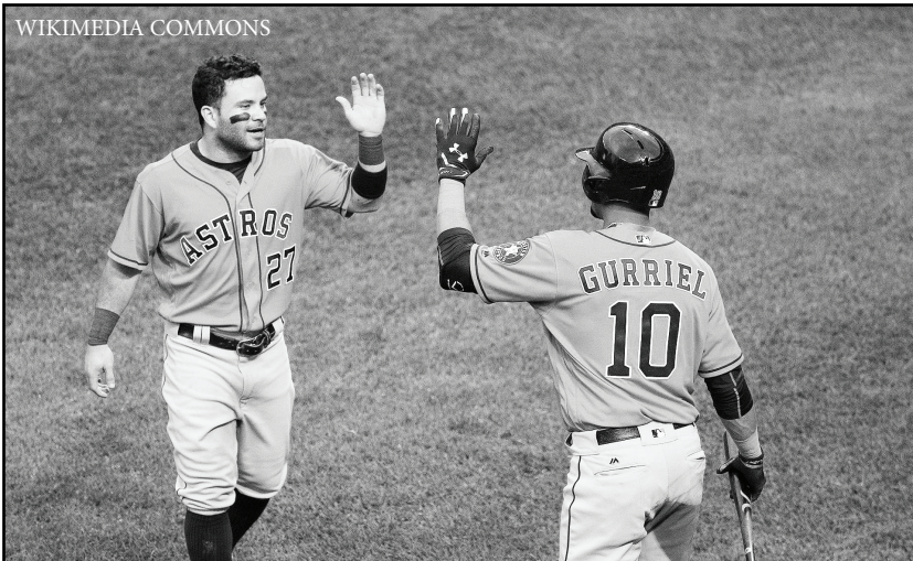
Yulieski Gurriel high fives teammate Jose Altuve

Anaheim was a pick by many to win the Stanley Cup, let alone the Western Conference. With Lindholm and Vatanen just returning, and Ryan Getzlaf finally getting healthier enough to play, things are looking up for the Ducks. But things could get even better when Fowler, Bieksa, and Kesler return.