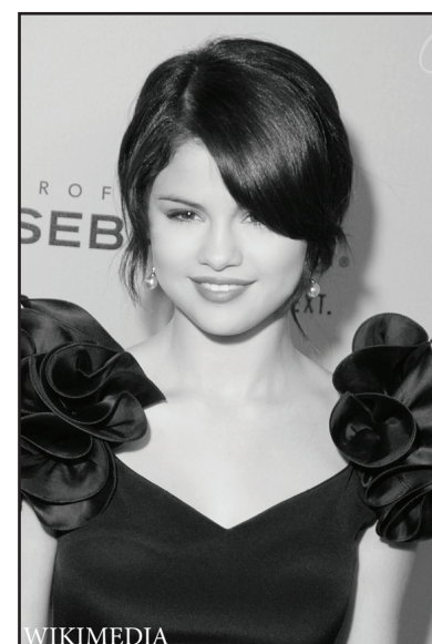
Selena Gomez messaged a suicidal fan.

Selena Gomez has been a frontrunner in the conversation about mental illness as of late. This makes it come as no surprise that when a fan posted a suicide note to a Selena Gomez fan account, she jumped in and came to her rescue.