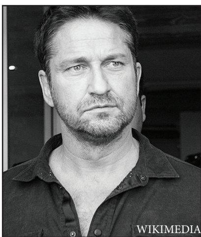
Gerard Butler, star of “Geostorm”

launch the system begins malfunctioning, causing weather catastrophes around the globe. It’s up to Jake and younger brother Max (Jim Sturgess), who works for the President, to solve the mystery and save the world.