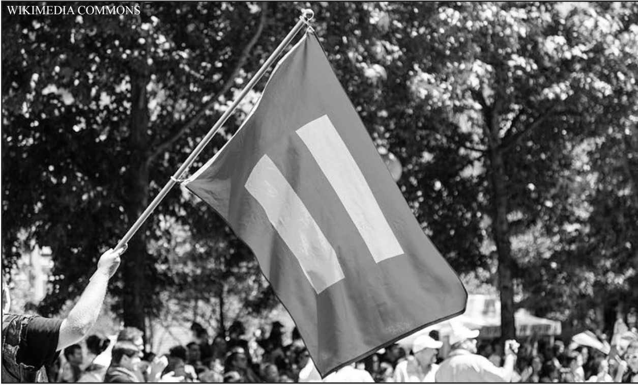
The President of the Human Rights Campaign spoke out against Trump’s comments about Pence’s beliefs.

First, let’s take a look at Trump’s role in the situation. In regards to LGBTQ+ rights, neither Trump nor Pence are supporters, but Pence is known