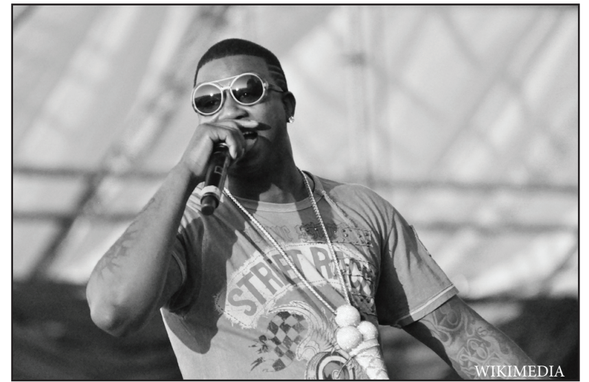
Gucci Mane’s extravagant wedding is set to be televised as a miniseries in part with his reality television show