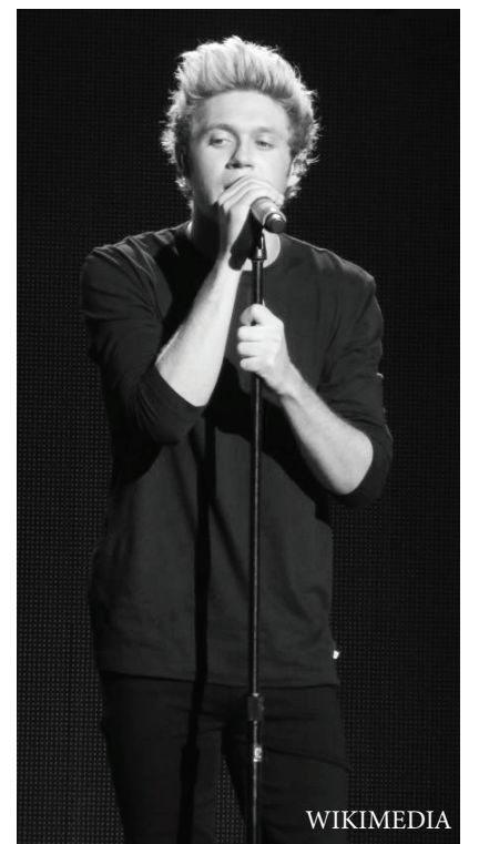
Nial Horan released new solo album, “Ficker”

He stated on Twitter that the title track “Flicker” was the most personal, even though they are all very personal. Horan also told Zane Lowe on Beats 1 Radio that “Flicker,” means the most to him and “was a very poignant moment in the recording process,” which “changed the way I recorded the rest of the album.”