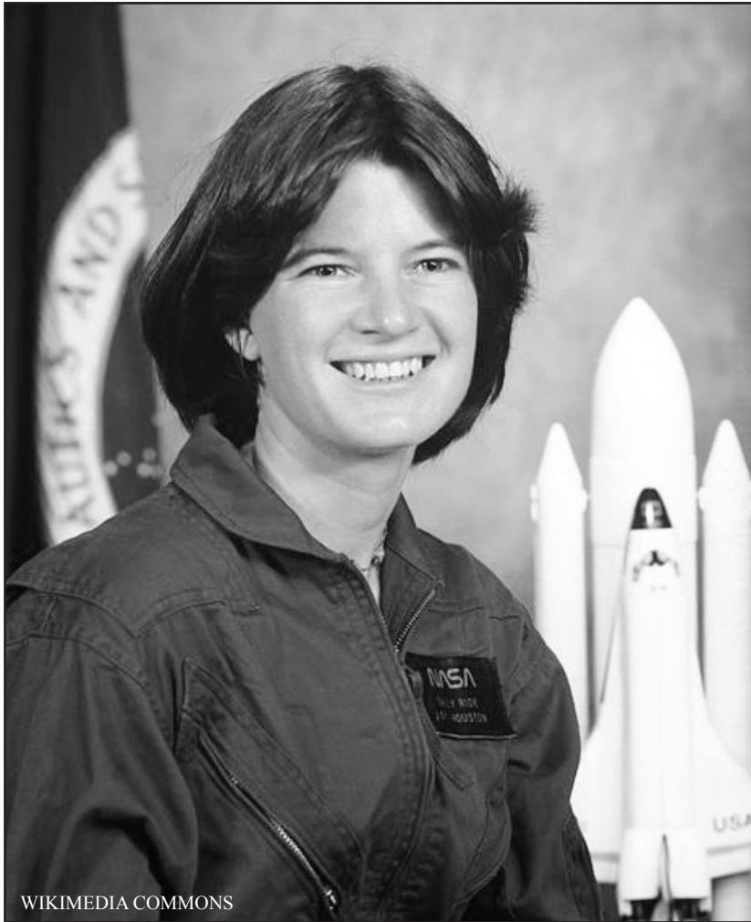
Sally Ride became the first American woman to go into space in 1983.

The $24.99 set includes important pieces such as a launchpad and space shuttle challenger with three removable rocket stages that come with Ride and Jemison, Hamilton's stack of books that represents the listings of the Apollo Guidance Computer (AGC) software source codes, and a