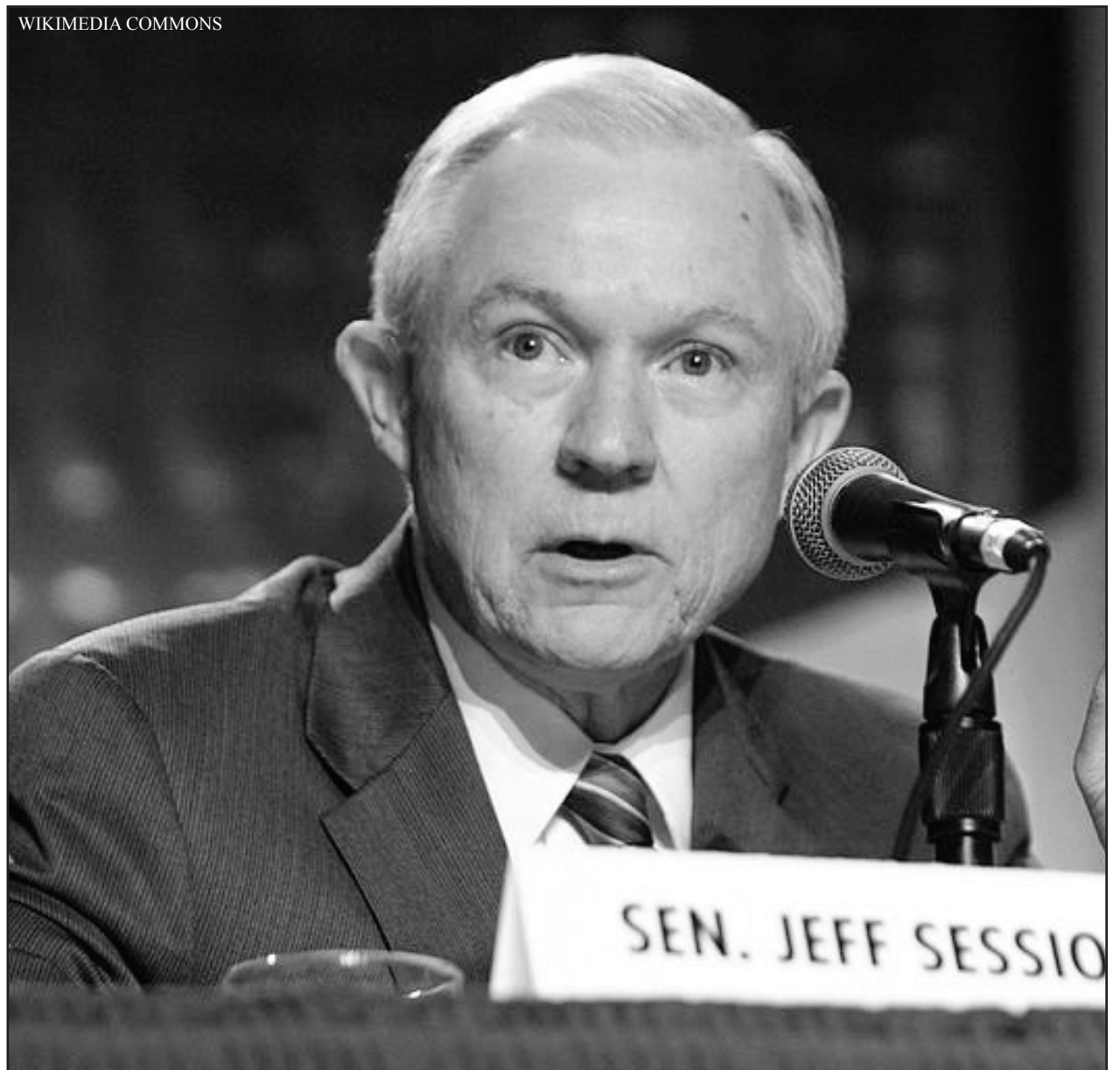
Sessions testified on Wednesday at Capitol Hill.

Sessions clarified this misunderstanding on Wednesday in response to Franken's "blanket denial" accusation