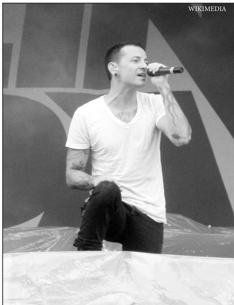
Chester Bennington died in July. The Linkin Park Carpool Karaoke

The episode begins with an in memoriam sign for Benning-