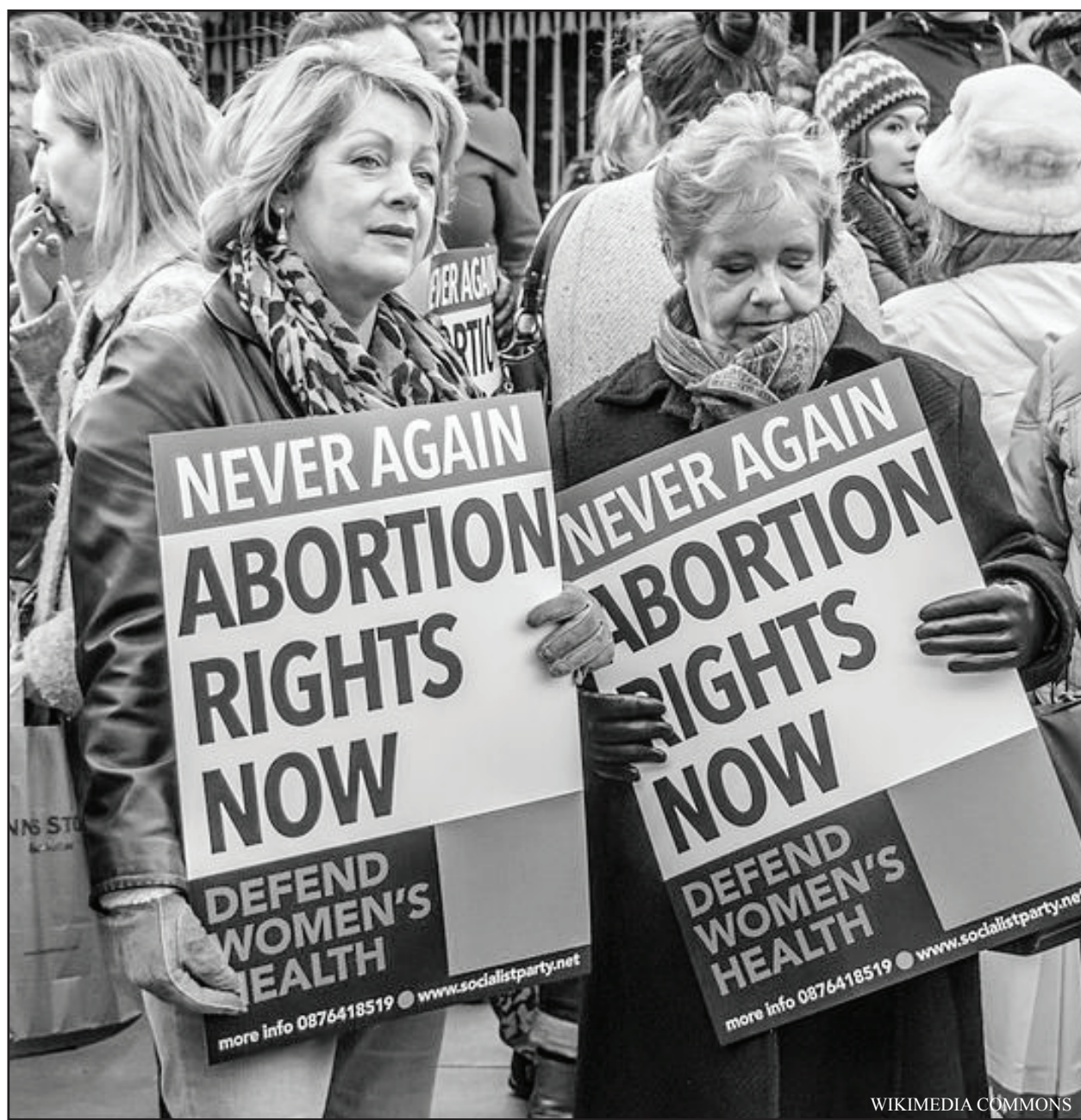
Protestors in Dublin rally for women's rights after an Indian woman died from being refused an abortion.

The Bible states, "Now to the unmarried and the widows I say: It is good for them